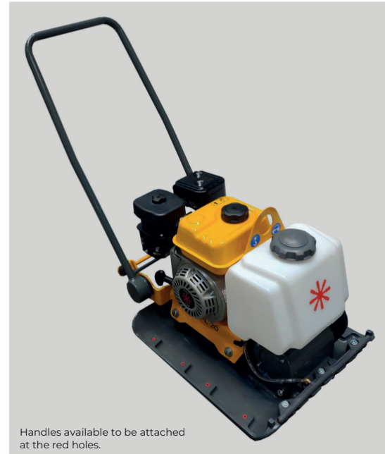
Handles available to be attached at the red holes.

Recommended for working in asphalt and light mixed soils as well as for the vibration interlocking paving stones